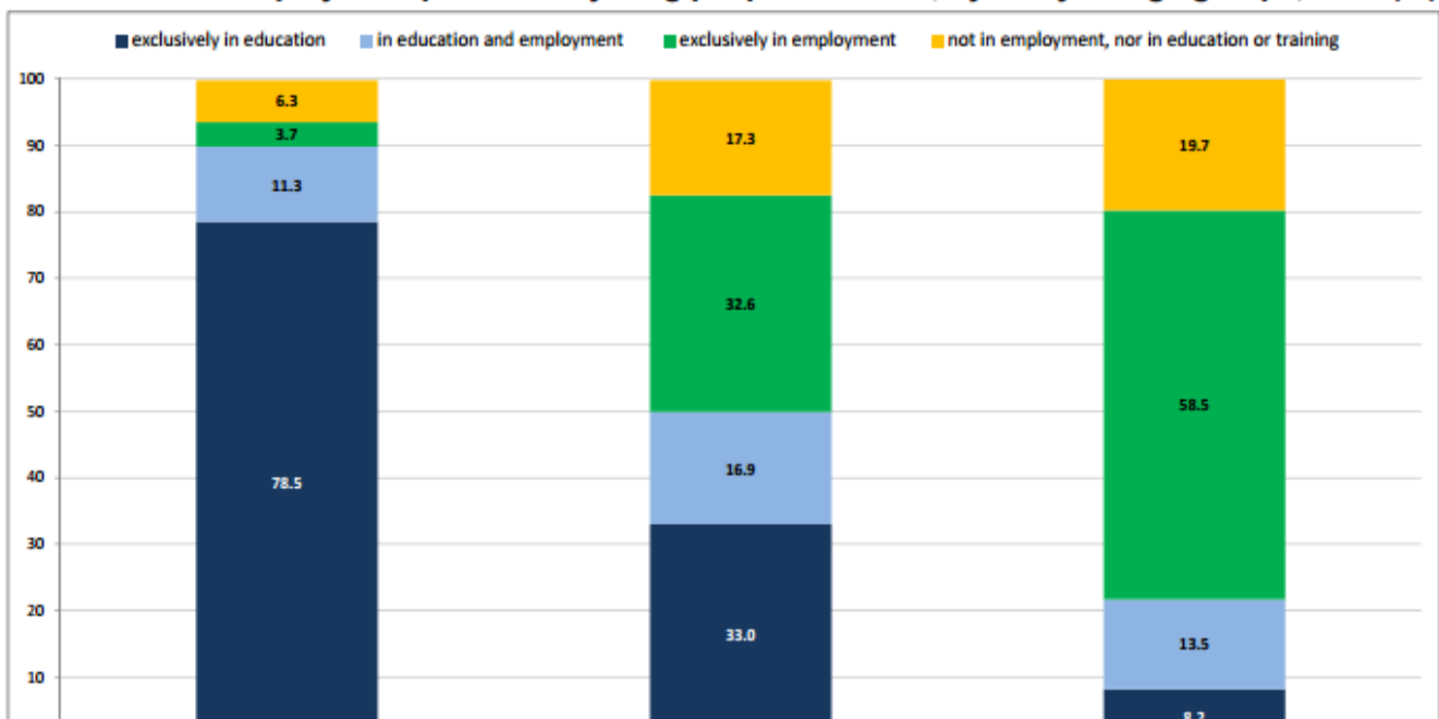
Education and employment patterns of young people in the EU, by five-year age groups, 2015 (%)

The NEET rate, which stood at 6.3% for the age group 15-19 in 2015, almost tripled to 17.3% for the age group 20-24 and reached almost 1 young person in 5 aged 25-29 (19.7%). This information is issued by Eurostat, the statistical office of the European Union, on the eve of the International Youth Day. This News Release shows only a small selection of the wide range of data related to young people in the EU available at Eurostat.